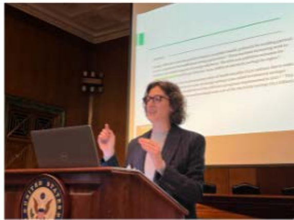
Scenes from ACEEE's Energy Efficiency Policy Forum and the launch of the 2023 Energy Efficiency Impact Report