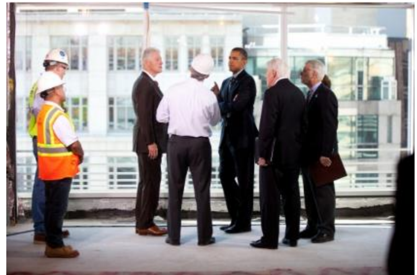
President Barack Obama and former President Bill Clinton take a tour of the upgrades of the Transwestern Building in Washington, Dec. 2, 2011