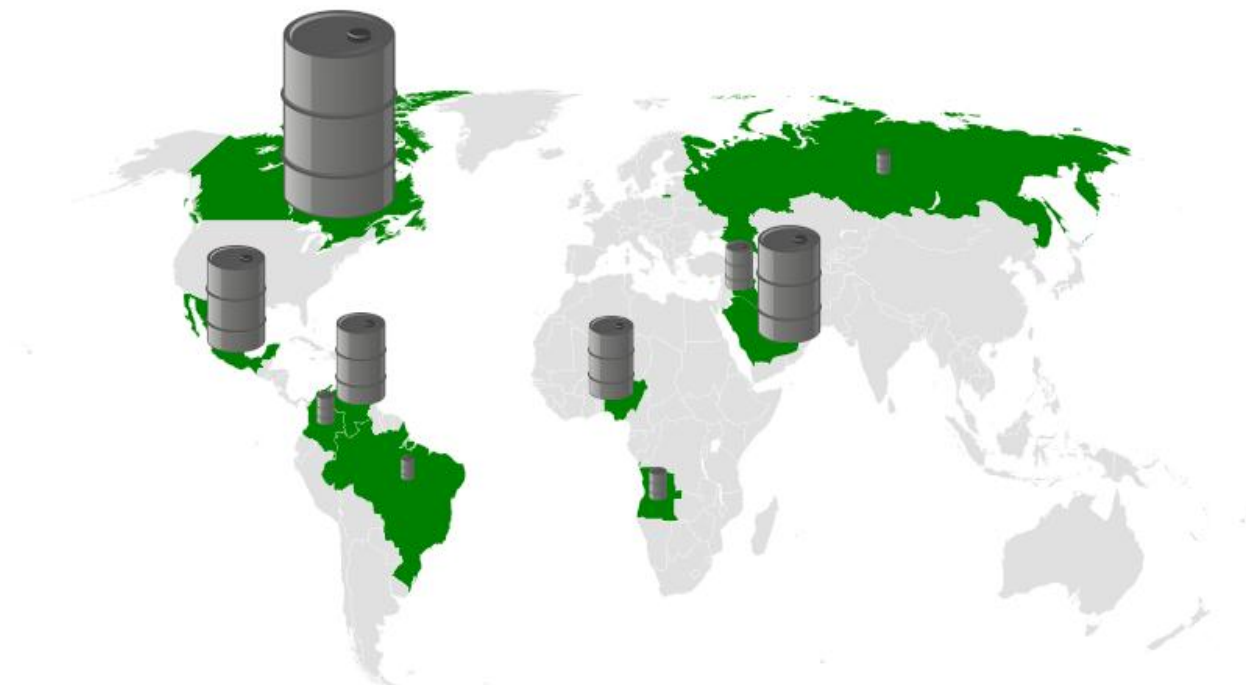
Figure 2. Top Ten Suppliers of Crude Oil to the United States

Note: The size of each oil barrel is proportional to the percentage of imported oil originating in that country.