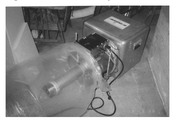
Figure 2. The Aeroseal Tubing Connection