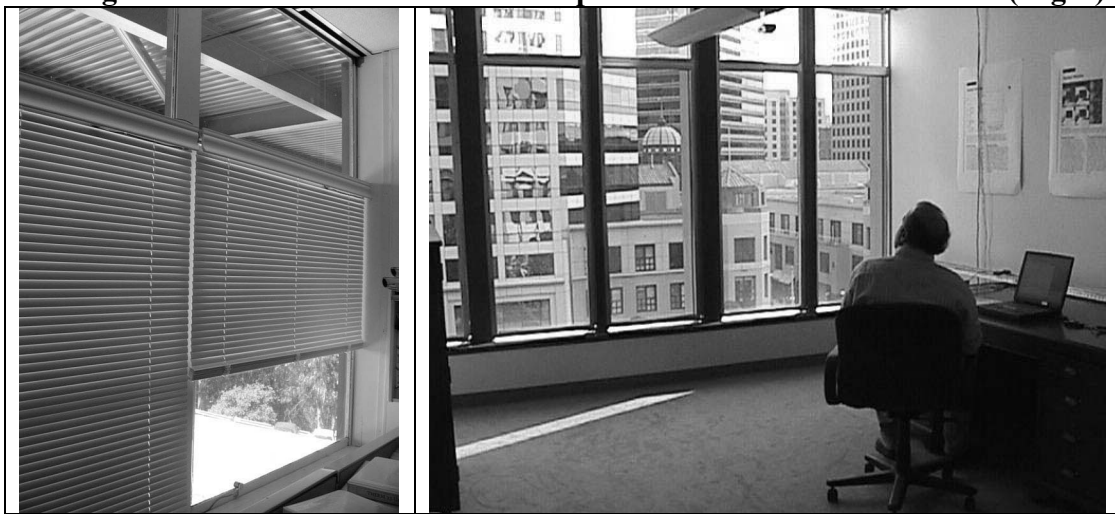
Figure 2. Automated Venetian Blind System Based on Dallas Semiconductor 1-Wire® (Left) and Large-Area Electrochromic Windows in Oakland Federal Building with Windows in Bleached on Top and Colored State on Bottom (Right)

Costs vary so widely depending on size and type of fabric/finish that manufacturers find that defining costs is not possible to answer easily or concisely. Hakkarainen of Lutron Electronics, Inc. states: “The bottom line is that energy savings alone do not justify the purchase of these products. Other factors, such as user comfort and convenience, have to be evaluated and appreciated in order for the owner to buy the system.”