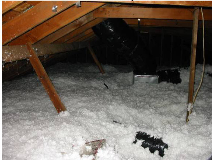
Figure 4. New Flex Ducts in Attic Covered by Additional Blown-In Insulation