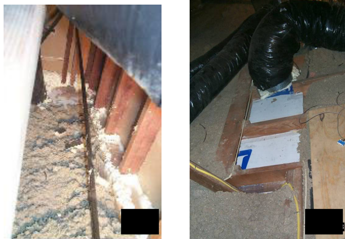
Figure 3. Sealing Cavities Connecting the House to the Attic

Foam was used for sealing small holes and cracks at building component intersections (left). Duct board insulation was used to block off large open areas (right).