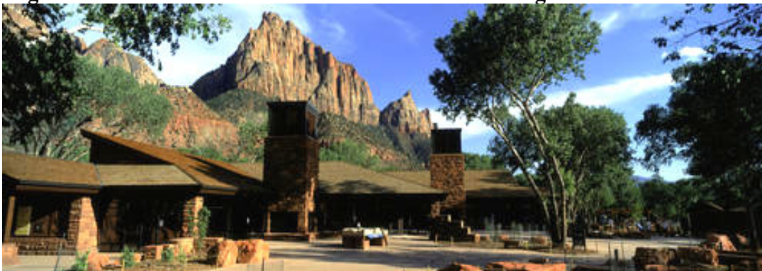
Figure 2. Zion Visitor Center North Elevation Showing Cooltowers and Plaza

The building's energy performance has been evaluated since it was occupied in May 2000. The integrated design resulted in a building complex that costs $0.43/ft 2 to operate and consumes 27.0 kBtu/ft 2 /yr. During the monitored year, the PV system produced a net 7,900 kWh (building normalized to 2.3 kBtu/ft 2 /yr) or 8.5% of the annual energy use. The cooltowers eliminated the need for conventional air-conditioning. Localized electric heating systems augment passive solar heating. The heating system is controlled to purchase electricity for heating when demand charges will not be incurred. This system eliminated all ductwork and fuel storage from the project.