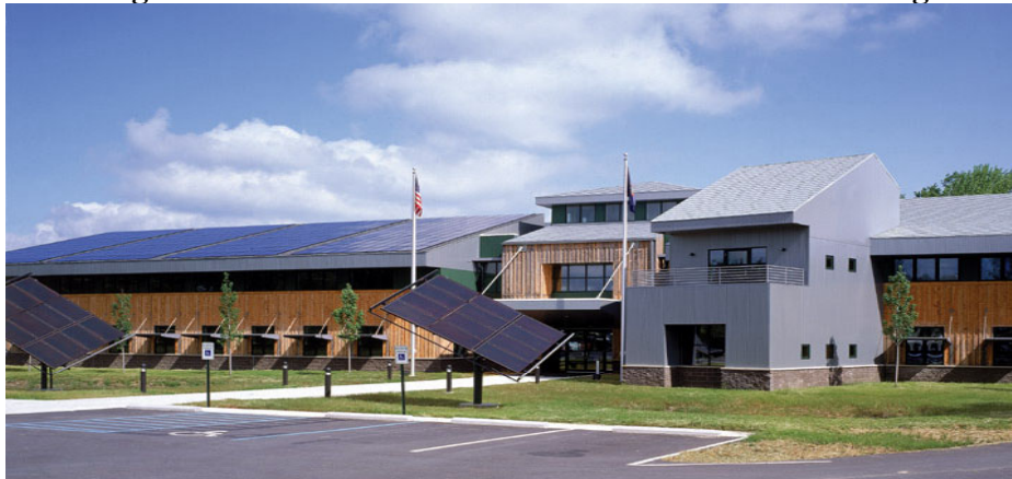
Figure 5. South Facade of the Cambria Office Building

The integrated energy design of this all-electric building produced an energy saving of 40% and energy cost saving of 43% compared to ASHRAE 90.1-2001. The lighting design and HVAC efficiencies contributed most of the savings. Some daylighting was used; although, the energy saving is minimal. The PV covers about 40% of the roof and provided approximately 2.7% of the annual energy. Operational problems with the PV system have been corrected and the energy production is expected to double in the future.