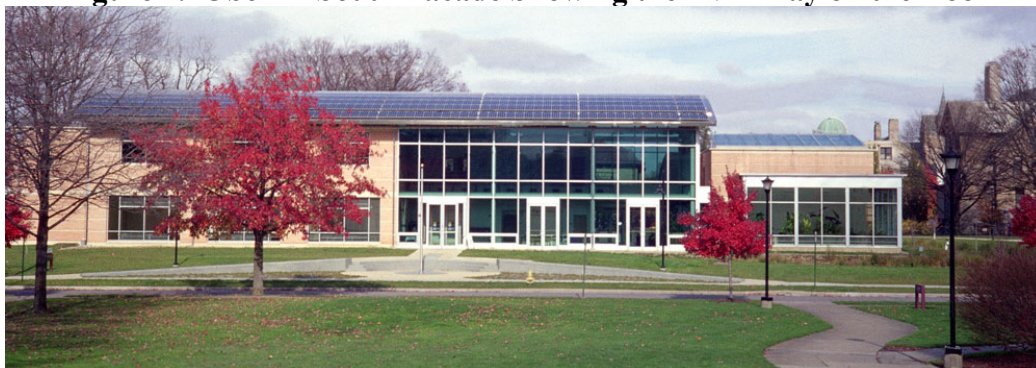
Figure 1. Oberlin South Facade Showing the PV Array on the Roof

The measured annual site energy use was 29.8 kBtu/ft 2 /yr, or 47% less than the ASHRAE 90.1-2001 code compliant building for a typical meteorological year (TMY2). PV panels provided 45% of the total electric load of the building [Torcellini, 2002] for a net site energy use of 16.4 kBtu/ft 2 /yr. As a point of reference, the energy use is less than half of the average