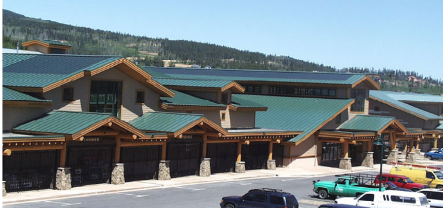
Figure 3. BigHorn Home Improvement Center

The integrated design of the BigHorn Home Improvement Center produced source energy savings of 54%, energy cost savings of 53% with annual energy costs of $0.43/ft 2 /yr. The lighting design and daylighting reduced lighting energy by 93% in the warehouse and 67% in the retail and office areas. The reference case is based on ASHRAE 90.1-2001. The PV system provides 2.5% of the annual electrical energy with a highest monthly percent of 7.3% in July 2002. Operating problems with the PV system have reduced the annual performance by approximately two thirds of expected amounts.