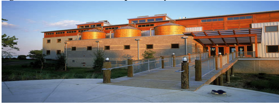
Figure 6. Photo of the Chesapeake Bay Foundation North Facade

The Merrill Center uses a ground-source heat pump system for heating and cooling. Forty-eight wells, each 300-ft deep, use the earth as a heat sink in the summer and a heat source in the winter. A glazed wall of windows on the south contributes daylight and passive solar heating. Sensors automatically turn off lights when daylighting is strong. The shed roof allows rainwater to be collected easily and used for fire protection, landscape watering, clothes and hand washing. Composting toilets also minimize water usage. Motor- and manually operated windows allow for natural ventilation. Fans are used to augment the natural ventilation system.