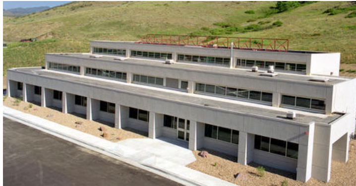
Figure 4. NREL Thermal Test Facility