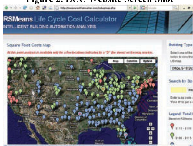
Figure 2. LCC Website Screen Shot

RSMeans has the cost information database for many types of buildings and intends to expand the LCC tool to these buildings in the future. Most buildings still use the lowest first cost building automation systems that meet the minimum specification requirements. With the advent of the green building revolution, many more buildings are seeking LEED or Green Globe certification requiring energy modeling and the potential for using the energy management systems to gain innovation credits. Life cycle costs are an important part of the integrated design process and more recognition is being given to the benefits of building automation systems that can optimize the sequence of operations, provide alarms as soon as problems occur and data log normal operations in real time to validate the energy model performance predictions.