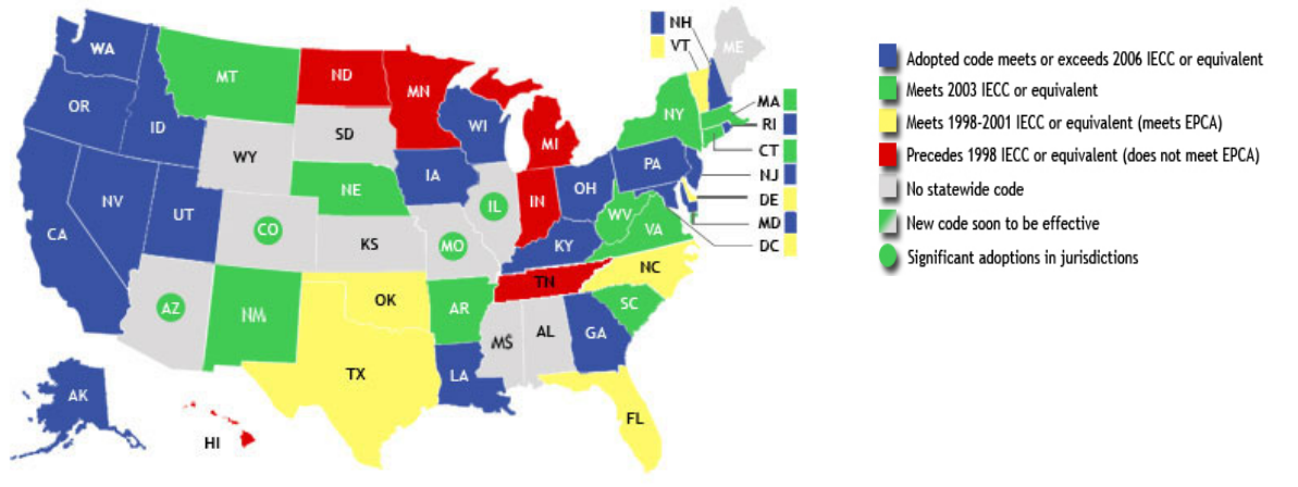
Figure 2. Residential State Code Adoption