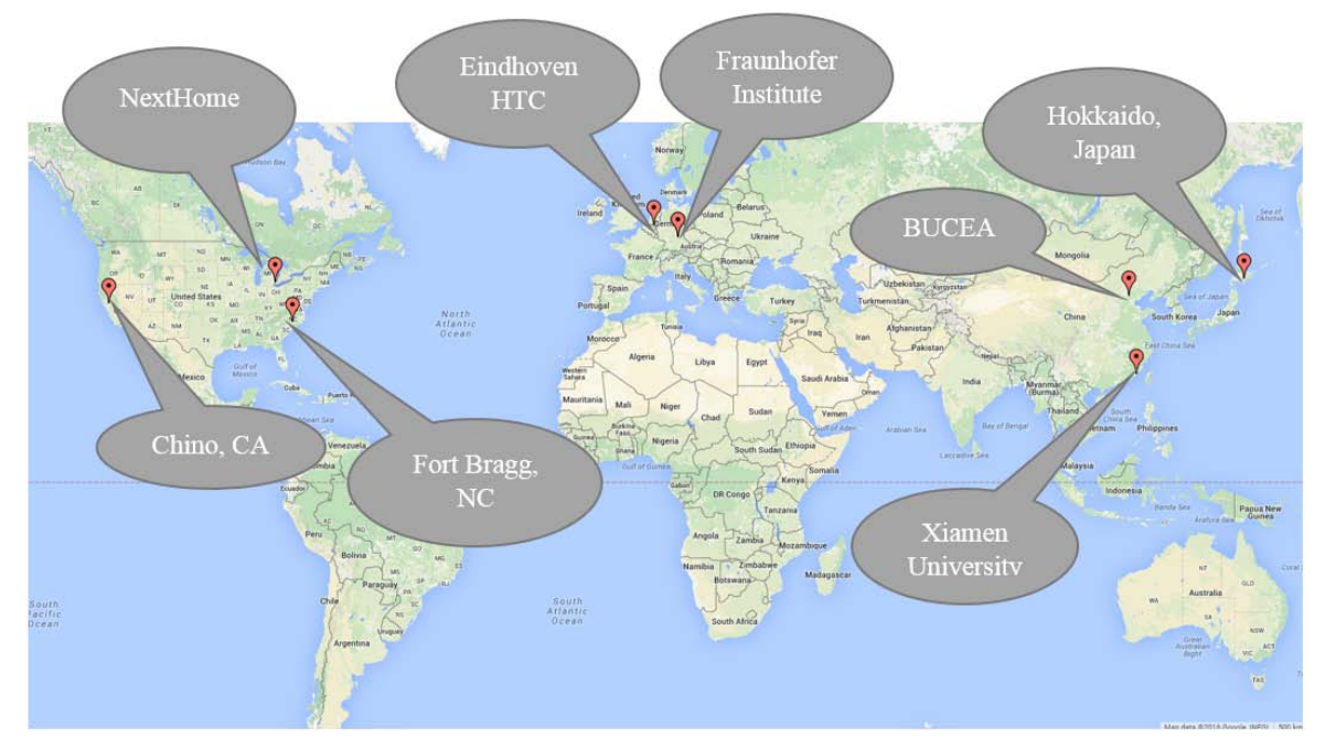
Figure 2. Worldwide Demonstration Sites for DC Distribution in Buildings