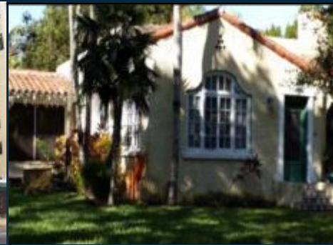
Madrid St – 6 units