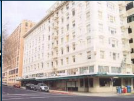
9th Street – 184 units