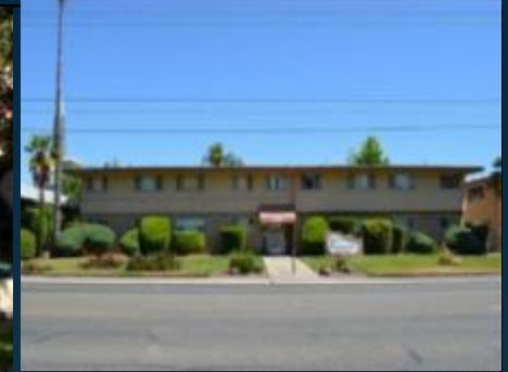
El Camino – 52 Units