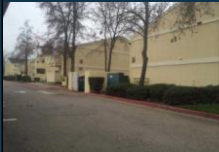
Madison Blvd– 86 units