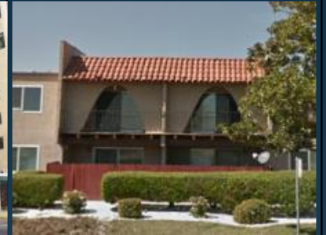
Land Park Drive