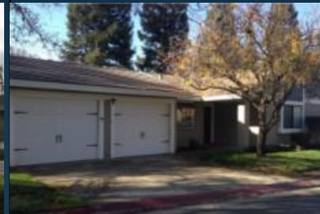
Sun Tree – 78 units