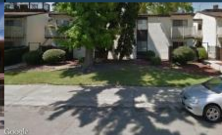
Windward – 84 units