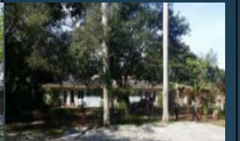
1st Ave – 6 Units