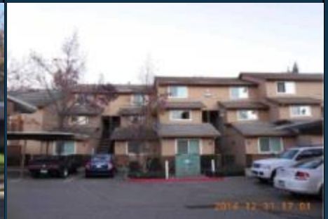
Sunrise Blvd – 60 Units