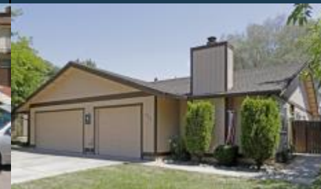
Ridgeside – 96 units