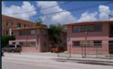
4th Street - 6 units