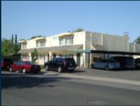
Mills Station - 21 units