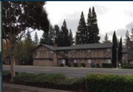
Riverside – 21 units