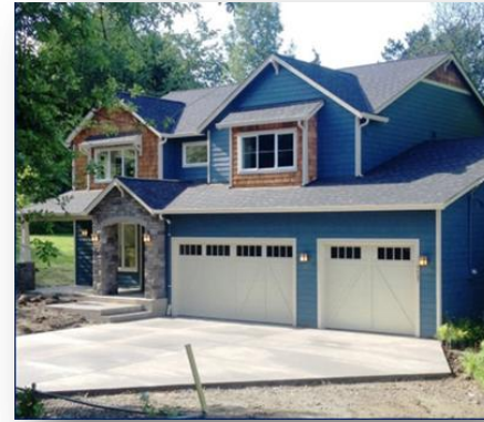
Residential New Construction