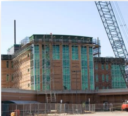
Commercial New Construction