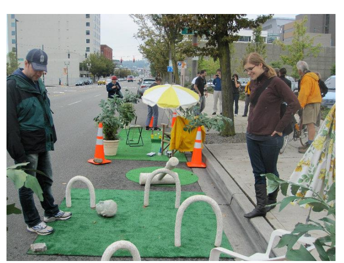
Tacoma's second PARK(ing) Day, during which nine parking spots were turned into parks for the day by different groups. DOTG hosted a walking tour of these spots during the lunch hour.

The City of Tacoma, Washington allocated $150,000 of its $1.4 million EECBG grant to a downtown Tacoma transportationfocused program named Downtown: On the Go! (DOTG). The program is a partnership between 18 downtown businesses and the Tacoma-Pierce County Chamber (the local business association), the City of Tacoma, and Pierce Transit (the local transit agency). The partnership aims to educate employers, employees, and anyone whose daily life includes travel in downtown Tacoma about transportation choices and the real costs of auto-centric development. The members of the partnership also work together to implement programs and services that encourage use of alternatives to single-occupancy vehicles,