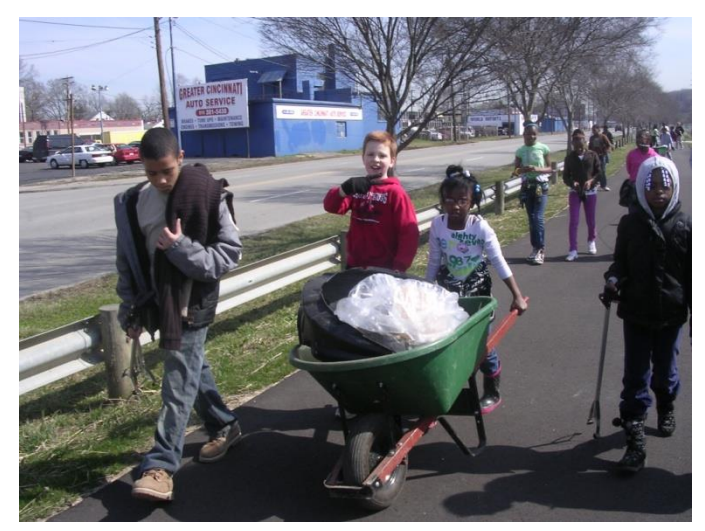
Students participate in service learning projects along the Mill Creek trail as part of MCRP's environmental education programming.