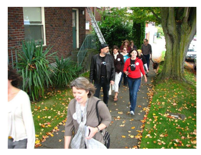
Participants in the first of DOTG's WALK Tacoma 2010 fall walking series. Throughout each of the five Fridays in October, a group walked one of the five WALK Tacoma walking map routes during the lunch hour.

Goals for the project include: (1) Working with downtown employers toward a goal of an 11% reduction in drive-alone trips by 2015 (a goal that is part of Washington State's and the City of Tacoma's climate action plan objectives and is projected to result in annual reduction in carbon emissions of 11,093 tons) and (2) Working with downtown leaders to determine the feasibility of and sustainable funding for a permanent transportation management association (TMA). Now that DOTG has an established work plan, goals, and a Board of Directors structure to guide the achievement of these goals, it can get to work on implementing its programs and services. These will move DOTG towards the