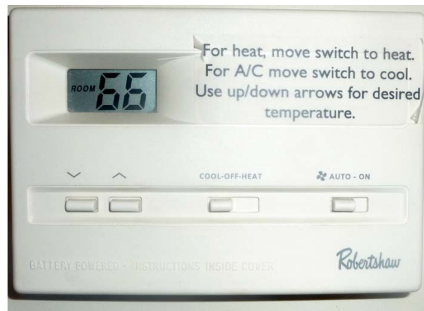
Figure 3. Folk label on a hotel thermostat

http://superfantastic.blogs.com/weblog/random/