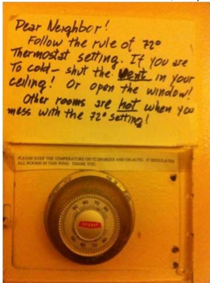
Figure 4. Folk label on a communal thermostat.

In large commercial buildings the room thermostat can be the final terminal/sensor of a more complex building management system. The photo in Figure 5 was taken in a laboratory at UC Davis. The verbose label, which looks more like an instruction manual, explains in detail the interaction between the central system and the local control. The label reads, “User control of Siemens room sensor with setpoint control and night override button.” We found that it was an