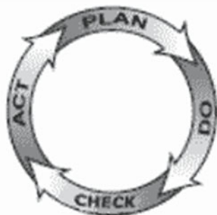
Figure 1: PDCA Loop (ASQ).

A number of approaches seek to embed SEM into organizations by leveraging continuous improvement methodologies. This effectively applies proven approaches from Total Quality Management (TQM) into energy management. A clear example of this is the evolution of the Deming Cycle, or PDCA Loop (Figure 1) into the “fish-hook” diagram commonly seen in energy management programs (Figure 3).