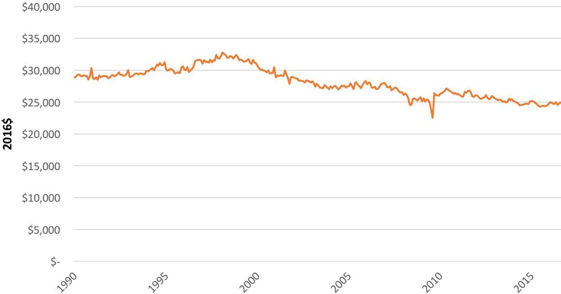
Figure 2: Average New Car Expenditure