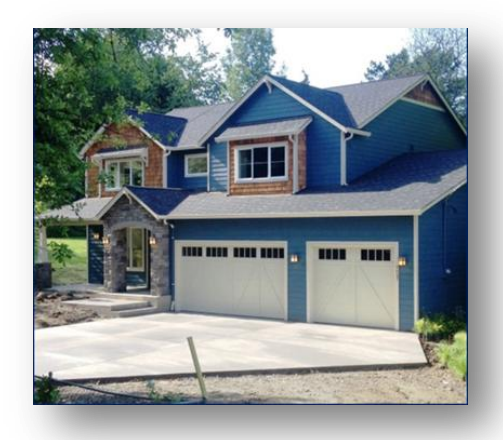
Residential New Construction