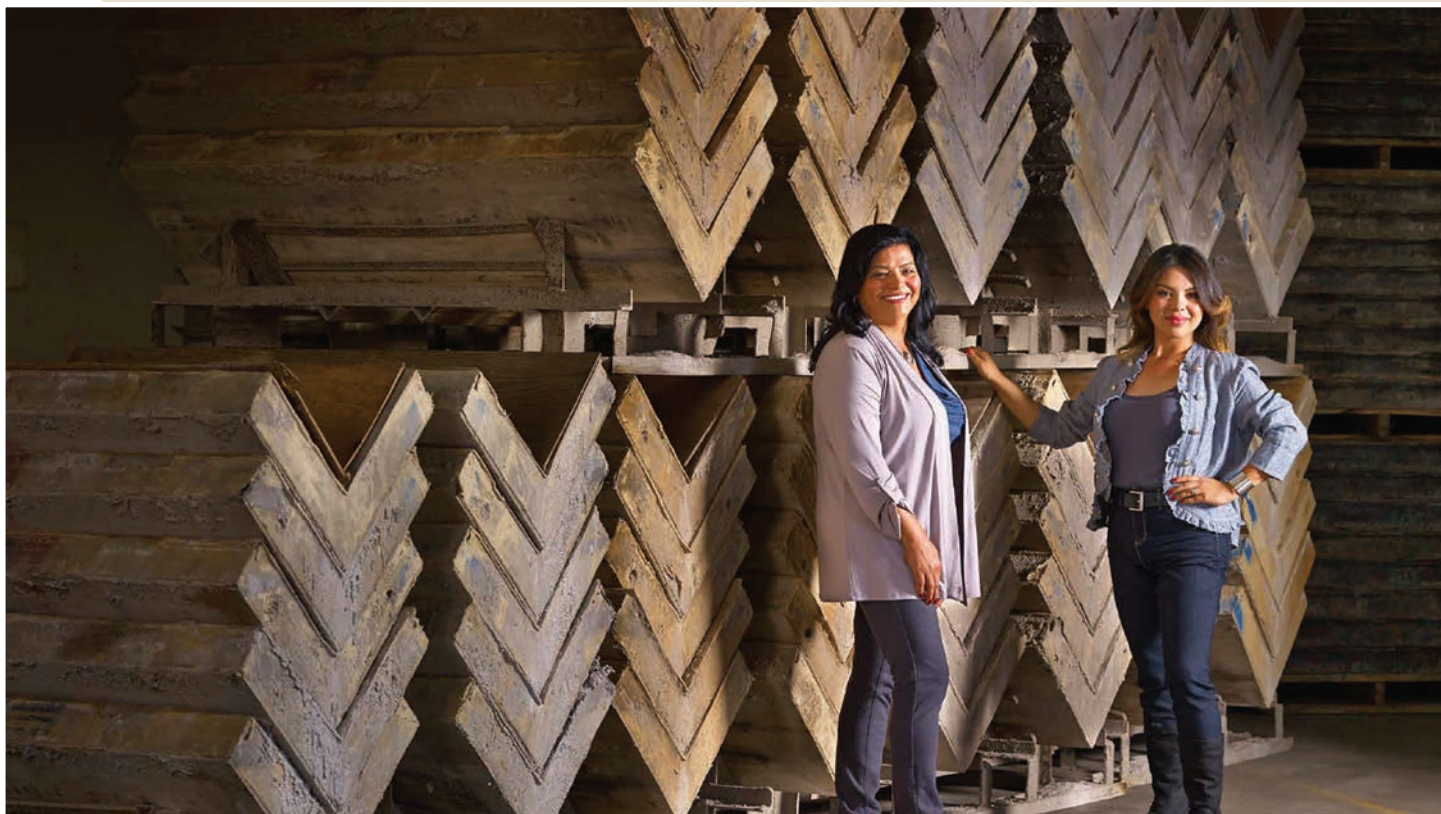
Boral's cultured stone product

The Boral Bricks factory in Muskogee, OK, employs 40 people who make more than 100 million bricks each year, from clay mine to kiln. A team from the Industrial Assessment Center at Oklahoma State University examined the plant and made recommendations including variable frequency drives on air compressors and on the carts used to move the bricks, capacitor banks to improve the power factor, reducing air pressure and fixing compressed air leaks, a better HVAC system (and cleaning the condensers), and better lighting. The plant invested $79,000 in efficiency improvements, which were expected to yield $63,000 in savings each year. For the plant, “lower plant costs mean lower prices for the consumer.”