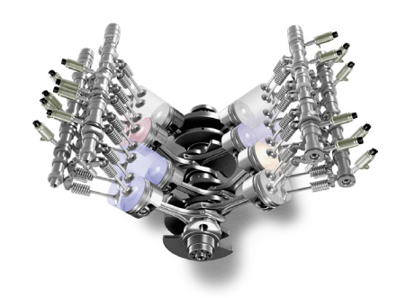
Figure 1: Cylinder deactivation.

Cylinder deactivation – Cylinder deactivation selectively turns off intake and exhaust valves and prevents fuel injection into some cylinders in the engine during light-load operation. In large-displacement engines, the vehicle's throttle valve is only partially open during light-load driving, which leads to pumping losses. Deactivating cylinders allows this throttle valve to open more fully, allowing air to flow more freely, which reduces drag on the pistons and pumping losses.